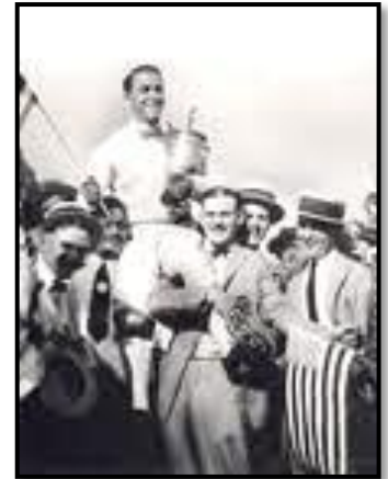
Gene Sarazen Wins 1922 Nation's Open at Skokie

Sarazen's shot at Skokie was the first of three memorable shots struck by him in golfing lore. While many in golf widely recount Sarazen's famous double-eagle on the 15th hole at The Masters in 1935, or his hole-in-one on the "Postage Stamp" par-3 8th at Royal Troon during the 1973 British Open, it was actually his "Driver Off-the-Deck" to our 18th green that propelled him into golfing history. Interestingly, in 2012 Links Magazine listed Sarazen's shot at Skokie as one of the best shots ever hit with a Driver in a U.S. Open. Gene's remarkable shot, and our club, is mentioned in the same breath as Ben Hogan's 1-iron to the 18th green at Merion in 1950 and Tom Watson's Wedge on the 17th at Pebble Beach in 1982.