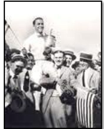
Gene Sarazen Wins 1922 Nation's Open at Skokie

Sarazen's shot at Skokie was the first of three memorable shots struck by him in golfing lore. While many in golf widely recount Sarazen's famous double-eagle on the 15th hole at The Masters in 1935, or his hole-in-one on the "Postage Stamp" par-3 8th at Royal Troon during the 1973 British Open, it was actually his "Driver Off-the-Deck" to our 18th green that propelled him into golfing history. Interestingly, in 2012 Links Magazine listed Sarazen's shot at Skokie as one of the best shots ever hit with a Driver in a U.S. Open. Gene's remarkable shot, and our club, is mentioned in the same breath as Ben Hogan's 1-iron to the 18th green at Merion in 1950 and Tom Watson's Wedge on the 17th at Pebble Beach in 1982.